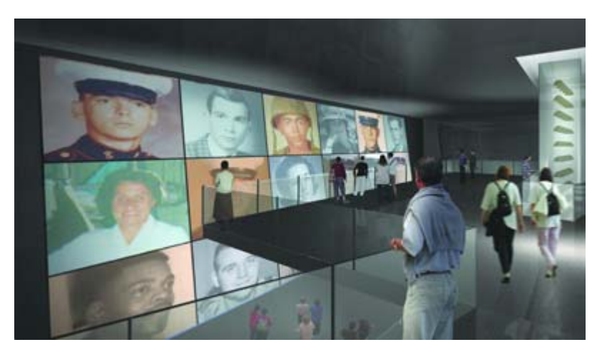
The Wall of Faces will show pictures of every person whose name is on The Wall. Images will be shown on their birthdays. (Rendering courtesy of Ralph Appelbaum Associates)

underground to preserve historic vistas, will be a simple and elegant facility that uses natural hues and elements to welcome visitors. (Rendering courtesy of Polshek Partnership Architects)