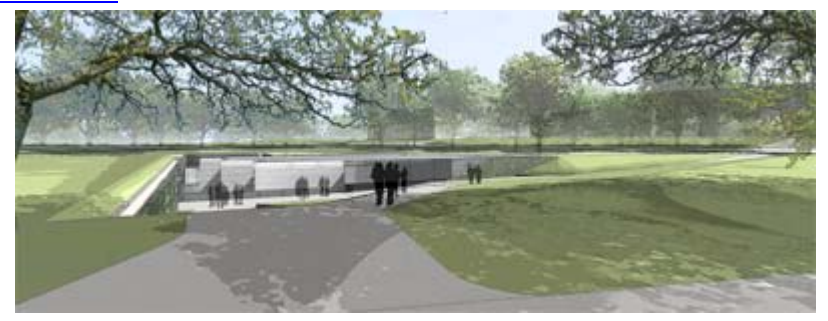
The Vietnam Veterans Memorial Center, while situated

Following are a variety of renderings of the Vietnam Veterans Memorial Center. If you would like to read about the planned design, click here.