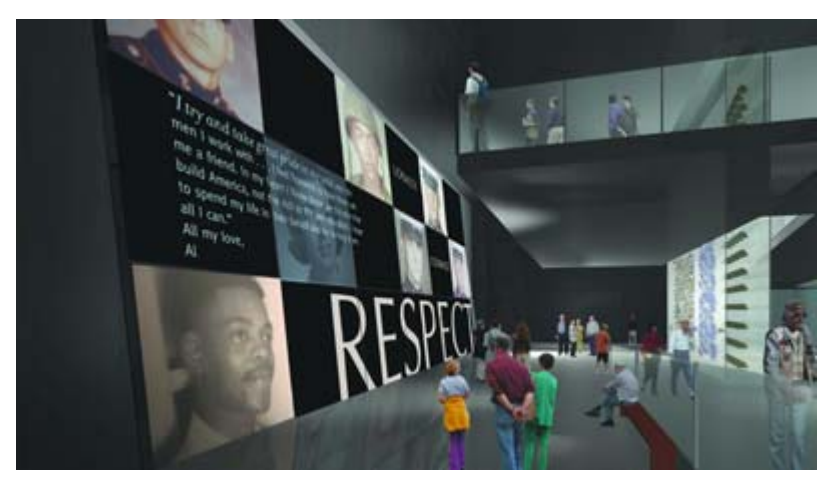
The Wall of Faces will also showcase some of the universal values of service members, through quotes from letters and journals. (Rendering courtesy of Ralph Appelbaum Associates)