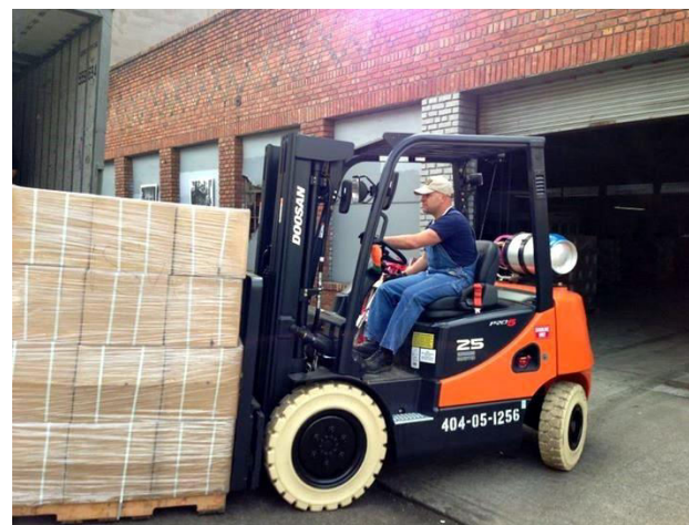
A pallet of equipment to deploy

"Now, we pretty much go straight to the manufacturer and acquire that same product, but we do it with funds that we raise internally," he told the Washington Examiner . Sometimes, the manufacturers donate the goods.