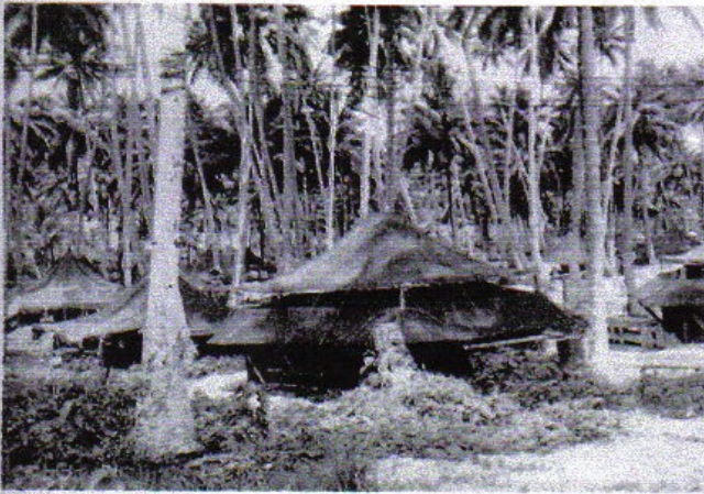
Camp Area on Green Island

supply system had been installed and most of the men's tents permanently erected with the drainage problem solved.