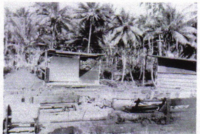
The Show's the Thing

A cargo ship arrived early the next morning and we